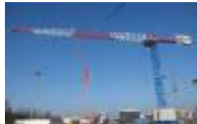
Raimondi MRT189 topless tower crane