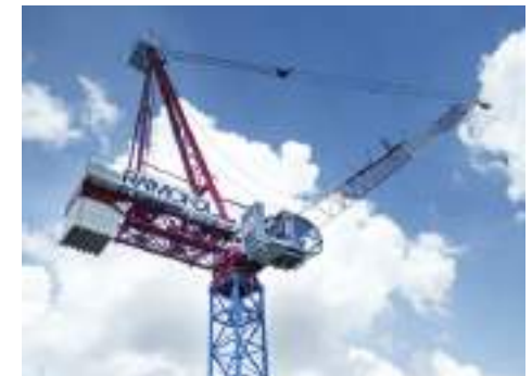
The LR213 luffing crane erected at Raimondi's headquarters

The most popular luffing crane in the Raimondi range, the LR213 is available with five different jib length configurations, from a maximum jib length of 55 meters to a minimum jib length of 28 meters, that can all reach the maximum capacity of 14,000 kg. The maximum tip load with 55 meter jib configuration is 2,250 kg. The LR213's noteworthy aspects include impressive hoisting performance, flexibility, and easy maintenance. Raimondi's LR213 luffing crane can lift the maximum load without reduction of capacity with the full jib of 55 meters. There is flexibility in choice with the LR213 as two different new hoisting winches at 55 kW or