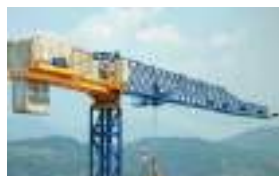
Raimondi MRT48 topless tower crane