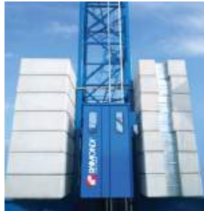
Raimondi MRT223 equipped with the first model of the elevator at JDL MED 2016