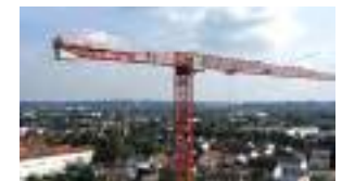
Raimondi MRT294 erected in Germany by Kwitek Krane