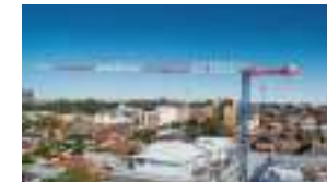
Raimondi Cranes in Sydney, Australia