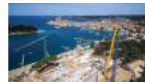
Klancar Cranes erected two Raimondi MRT186 cranes in Rovinj, Croatia