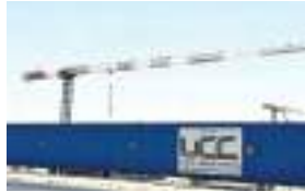
Raimondi MRT294 topless tower crane

Raimondi incorporates the latest in safety developments into our topless tower crane models, with a high functioning and intelligently-designed technological edge. Our range of tower cranes are extremely versatile and conceptualized fully in-house, with client needs taken into consideration during R&D phase. With a diverse set of capabilities, our solution-based crane designs deliver strong return on investment.