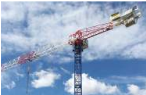
The MRT159 arrives onsite with all parts preassembled, ropes passed, and rope connections installed

The Raimondi MRT159, with a 65 meter jib length and a maximum tip load of 1650 kg, boasts a maximum load of 10,000 kg. The flexibility of the MRT159 now has more jib configurations available, and a selection of three different winches with respective powers of 30 kW, 37 Kw, and 45 Kw. The MRT159 arrives onsite with all parts preassembled, ropes passed, and rope connections installed. The small and useful accessories facilitate having everything necessary positioned close to point of installation.