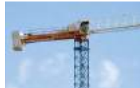
Raimondi MRT111 topless tower crane