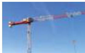
Raimondi MRT84 topless tower crane