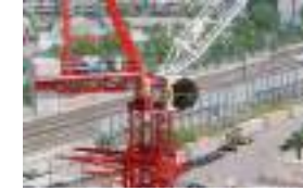
Raimondi LR165 luffing crane