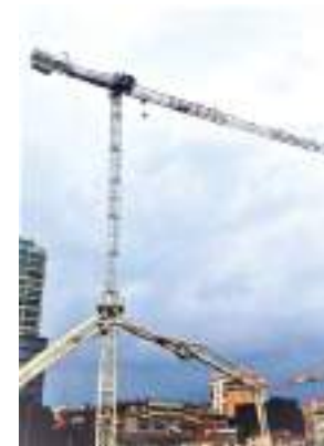
First Raimondi crane erected in Tirana, Albania

Precision European manufacturing of the finest heavy lifting machinery for more than 150 years has established Raimondi's products on premiere jobsites globally.