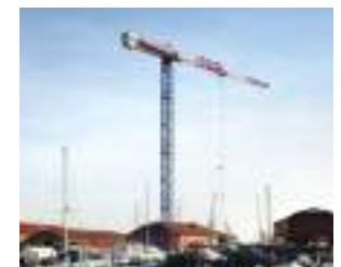
The Raimondi MRT223 tower crane erected in Chioggia, Italy