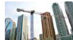
Raimondi MRT152 erected in Sharjah, UAE