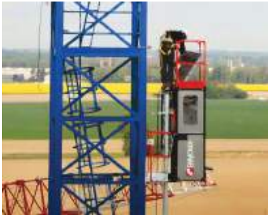
Raimondi MRT294 fitted with the newest elevator model, the SL20-TC

Raimondi Cranes is able to provide elevators for the newest models in the range, and retrofit previously manufactured models. Quality and attention to detail are part of the production pillars, together with ease of implementation and use. The company's elevator was developed with our exclusive supplier. The newest model, the SL20-TC, complies with Standard EN81-43 for Crane Lifts: Safety Requirements, and has front and side windows meant to facilitate easy crane inspection. Shown here are two different Raimondi models fitted with the crane elevators.