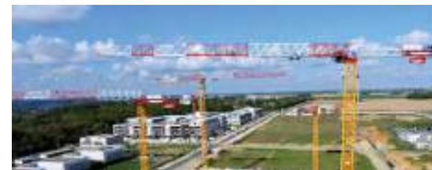
A total of six Raimondi cranes installed by GP MAT International in Paris, France