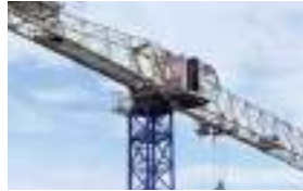
Raimondi MRT234 topless tower crane