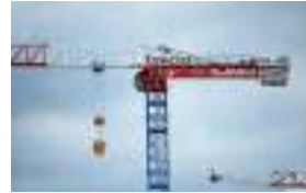
Raimondi MRT223 topless tower crane