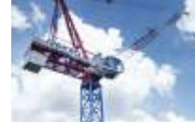
Raimondi LR213 luffing crane

Raimondi has devoted significant resources to our luffing jib crane segment. Especially relevant to jobsites with hard to obtain flyover rights, Raimondi luffers handle adeptly and allow for a productive and safe operational environment. Technical advancements in erection and commissioning, together with an improved slew sequence based on extensive study, have given Raimondi luffing cranes a strong market foothold.