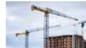
Two Raimondi MRT111s in Saint Petersburg, Russia