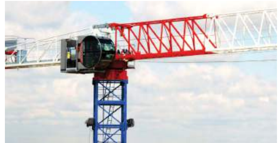
Raimondi MRT294 erected in France by GP MAT International

The MRT294 16 tonne is one of Raimondi's most popular models, specifically with general contractors and developers employing precast systems. Available with City/HC5s Tower: 2.10 m (6.9 ft.), the MRT294's attractive aspects include the maximum lifting capacity, and the 3.5 tonne at 70 meter tip load.