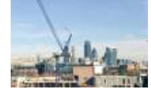
Raimondi LR60 luffing crane