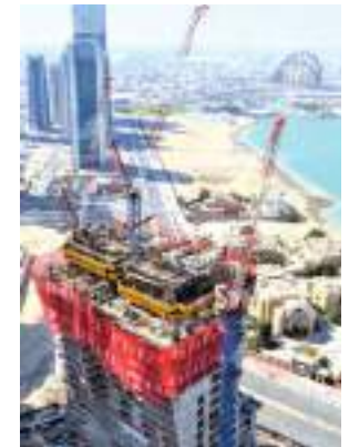
Three Raimondi LR213s erected in Doha, Qatar