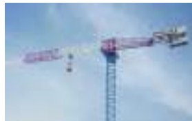
Raimondi MRT159 topless tower crane